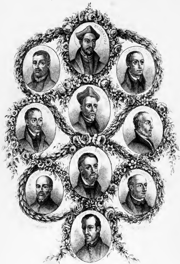
These Portraits are taken from a very ancient original, and are now in the possession of St Ignatius and the Jesuits.