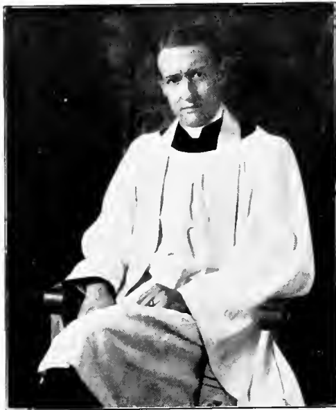
REV. WALTER WHITE REID MARCH 29, 1914—