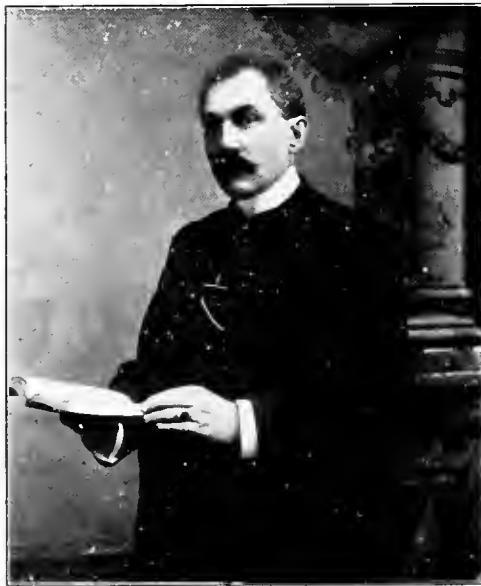
REV. WILLIAM F. DICKINSON MAY 28, 1887—OCT. 1, 1895