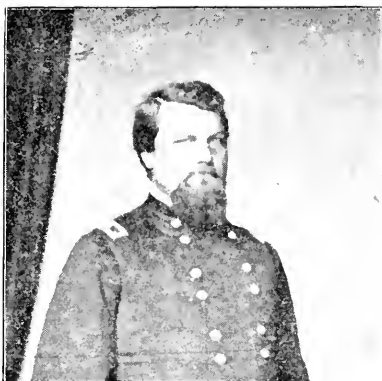
BRIGADIER GENERAL BENJAMIN F. POTTS.