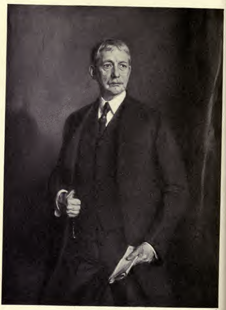
Portrait by Philip A. de László.