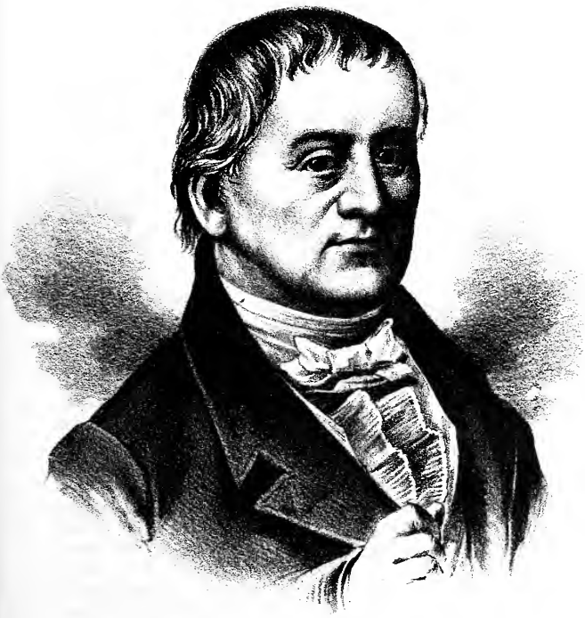
Col. Francis Vigo.