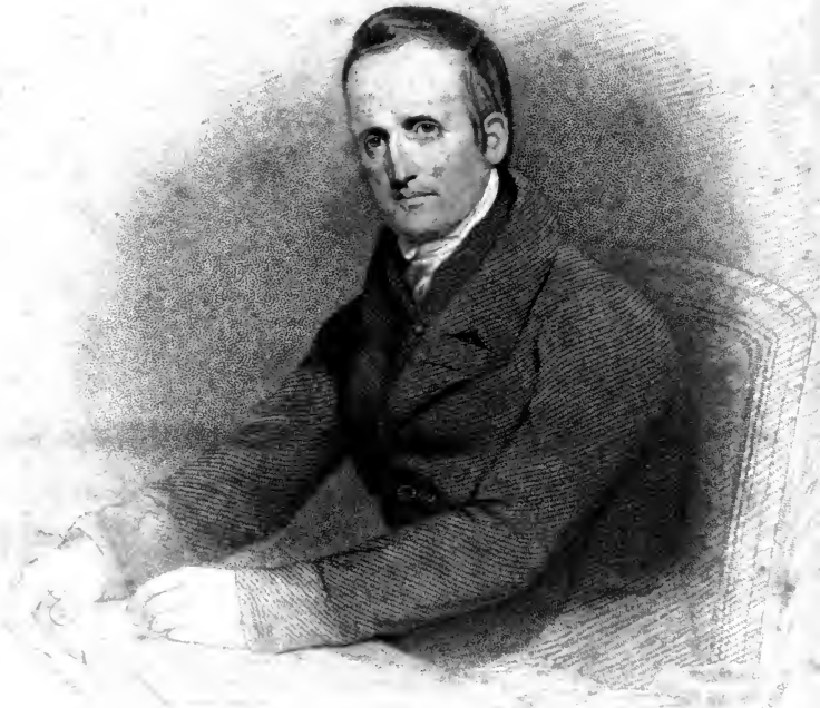
REV. JEREMIAH DAY, S.T.D., LL.D. PRESIDENT OF YALE COLLEGE