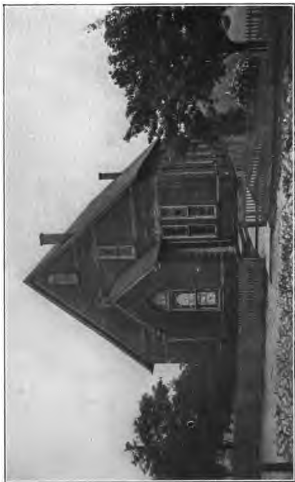
Old Zion Evangelical Lutheran Church (Harrold's)