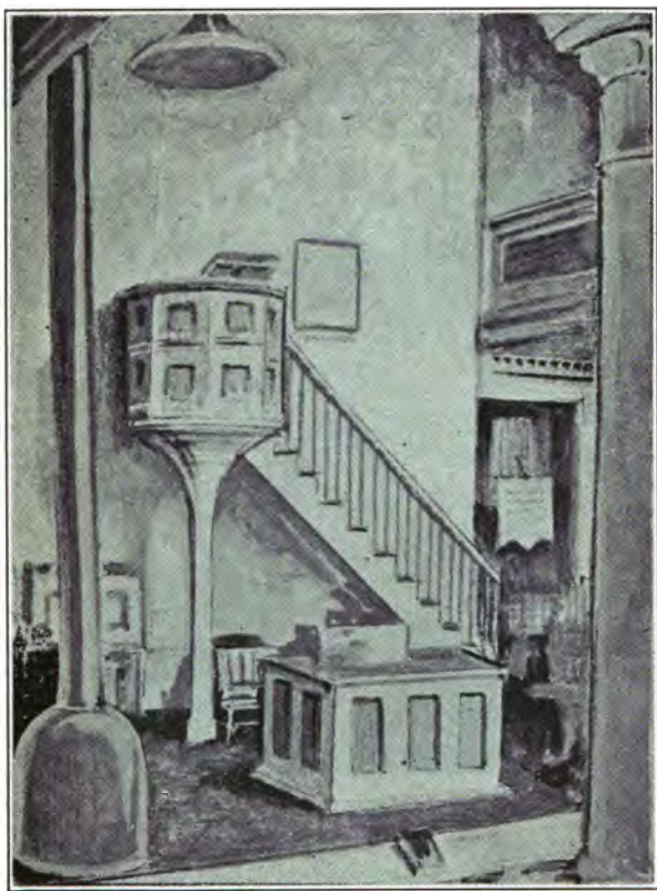
Wine Glass Pulpit from Old Stone Church

a high wine glass pattern with steps leading up to it. It rested against the wall in the north central side. It was the custom for the minister to conduct the opening service at the altar and