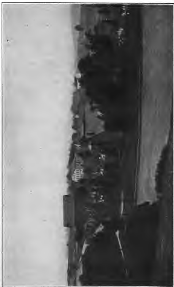
Birds-eye View of Portion of "Good Purpose" (Harrold's)