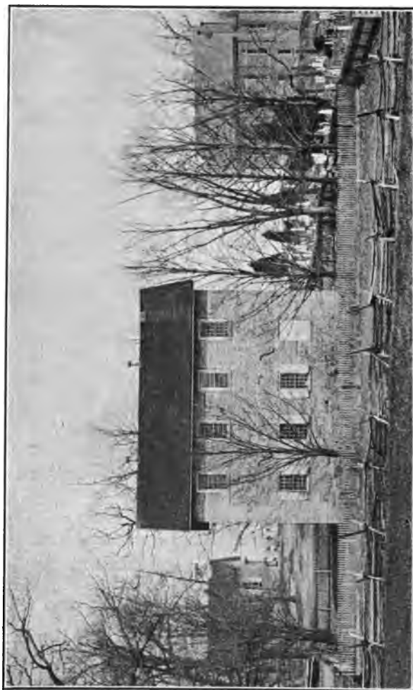
Old Stone Church