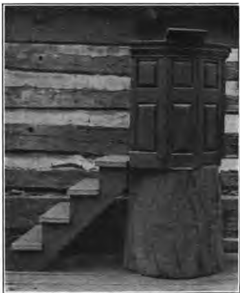
Quaint Old Pulpit from Old Log Church