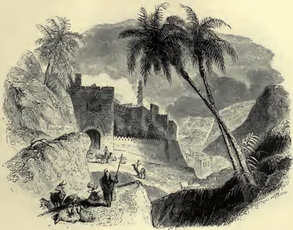
THE HILLS AND WALLS OF JERUSALEM.

PSALM CXXV. 2. NEHEM. iiii. iv. vi. xii. 27—47.