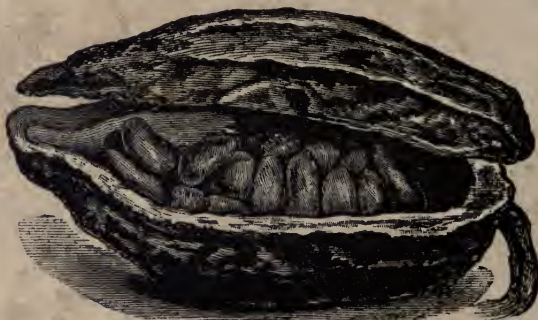
COCOA POD CUT OPEN SHOWING THE NUTS