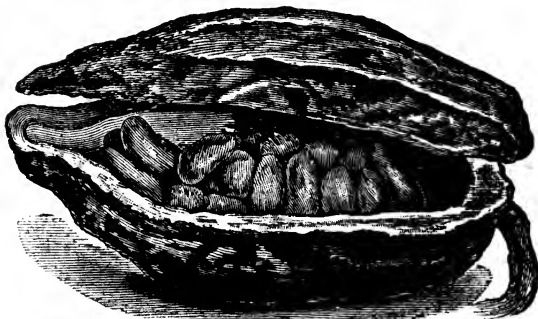
COCOA POD CUT OPEN SHOWING THE NUTS