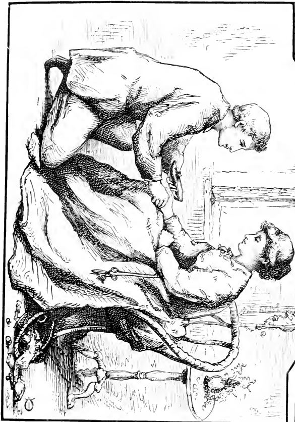
“Will Cinderella try the little shoe, and — if it fits — go with the Prince?” — PAGE 294