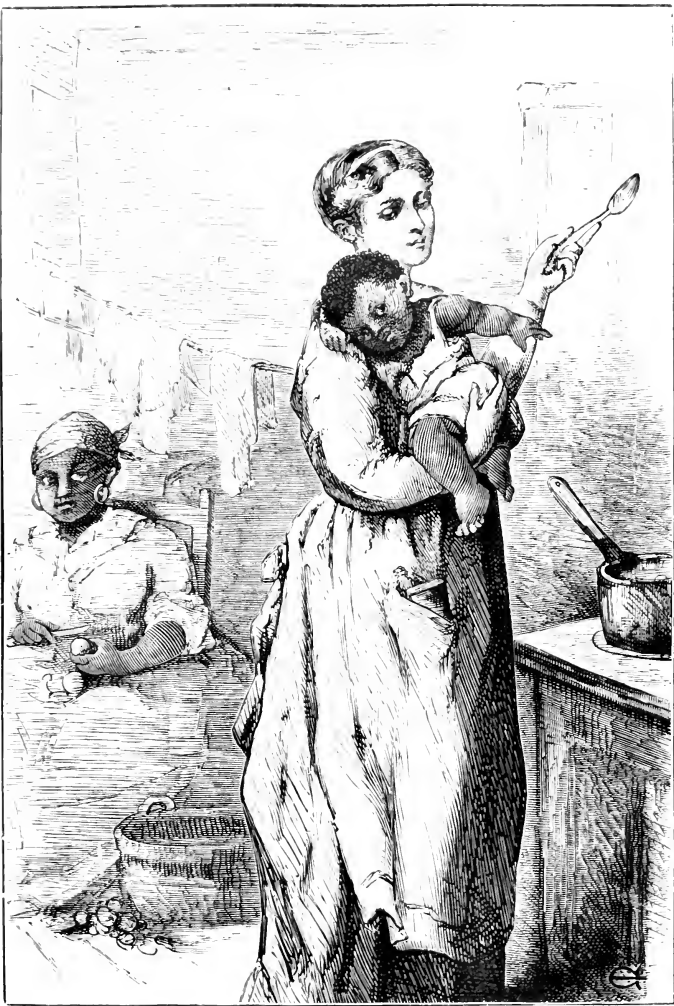
“One hand stirred gruel for sick America, and the other hugged baby Africa.” — PAGE 76.