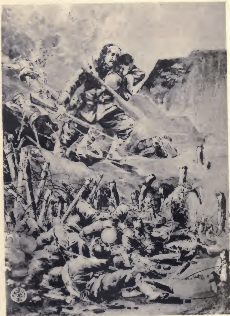
From the Painting by the Author with his Left Hand