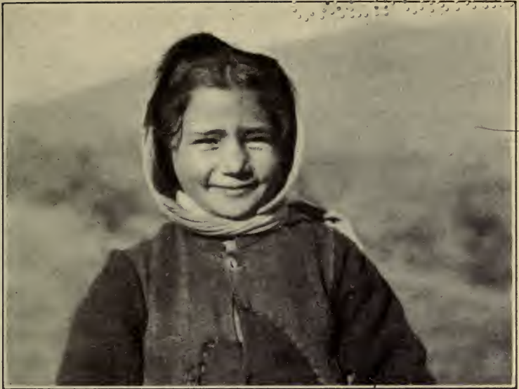
A SHEPHERD GIRL ON THE HILLS NEAR BRALO (Not far from Delphi, Greece.)