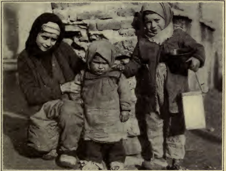
APPLICANTS FOR RELIEF At the American Red Cross Relief Station in Skoplie, Serbia.