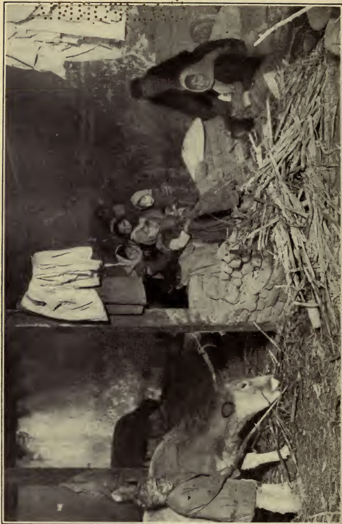
THE NIGHT BEFORE CHRISTMAS

Serbian refugees in the stable of an old Turkish inn at Leskowitz, Serbia.