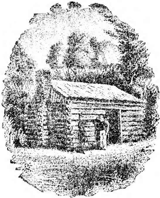
LINCOLN'S EARLY HOME IN ILLINOIS.