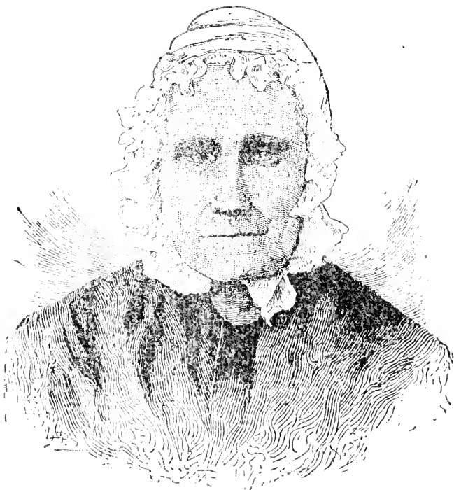
MRS. SARAH BUSH LINCOLN. Lincoln's Beloved Stepmother.