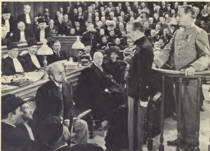
From a discussion

The case is given to the jury. They find Zola guilty.