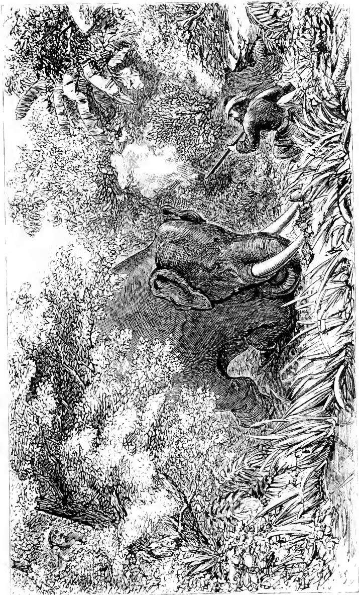
A CLOSE SHAVE.