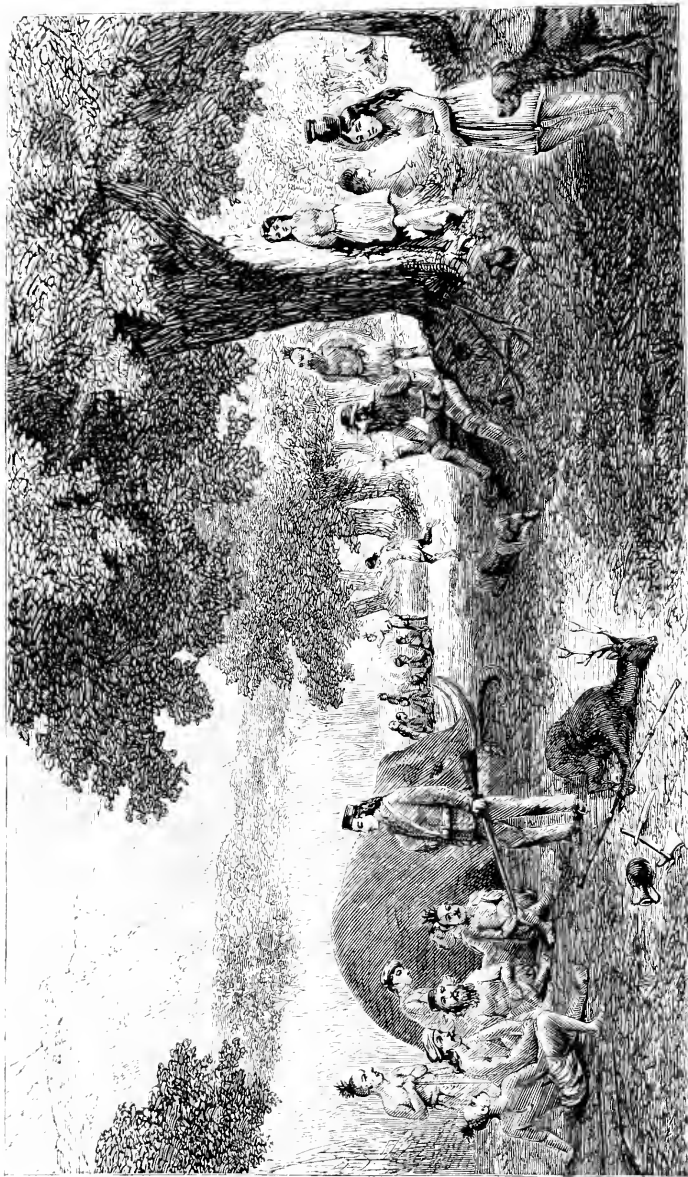
THE OLD SHEKARRY AND HIS GANG.