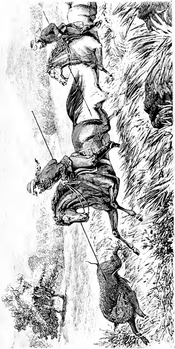
THE SPEAR WON