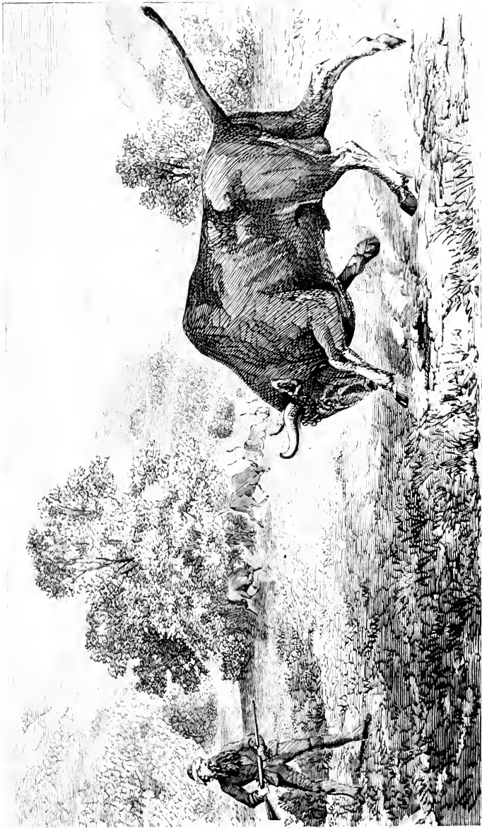
THE DEATH OF A BULL-BISON