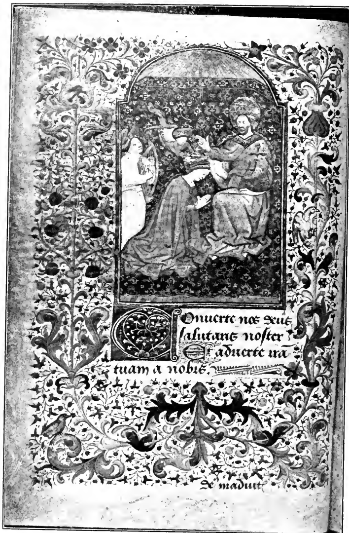
Hours B. V. Marie—15th Century, 163 pages (Codex Msc. 291). Photo-reproduction of Page 75 from the original in the Abbey of Maria Einsiedeln, "Initium Completorii" with Miniature "The Crowning of Our Blessed Lady" exquisitely executed in richly harmonizing colors set in a highly decorative floral border. This elaborate Hour Book also contains eleven full-page pictures masterfully illuminated with the utmost care to detail, and every folio is notable for its varying and highly ornate design.