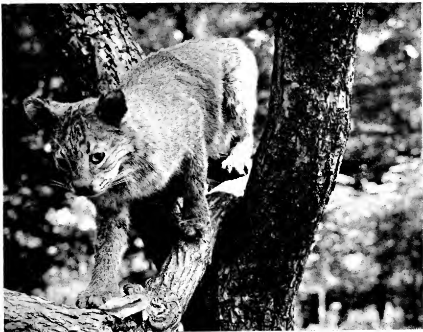
BOBCAT ( Lynx rufus )

It was dusk in the great swamp. The chuck-will's-widow called, and the mosquitoes made an undertone of humming which filled the forest. The swamp glimmered silkenly where the angular cypresses and tupelos stood tall and black. The noises rose and fell—the groaning and clicking of frogs, the squawk of a night heron, the querulous cry of a raccoon, the far-off bark of an owl, a sudden crashing in the underbrush. And then there came that call. It was a wild scream, a coughing cry, so fierce, so untamed, that even the chuck-will's-widow ceased on a half note, and momentarily there was pulsating silence as the creatures paused, quivering, and listened. The bobcat was at its hunting.