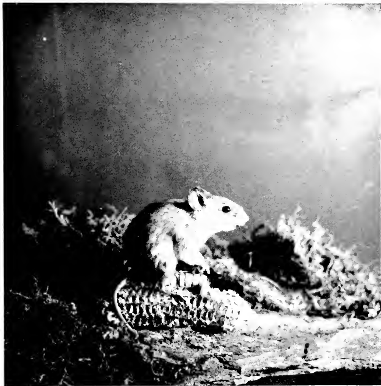
DEER MOUSE ( Peromyscus maniculatus )

A wide-awake little animal of the winter woods is the deer mouse—small, plump, grey-brown above, with clean white feet and underparts and a long, agile tail. The eyes are black and large, the ears soft and pink, the whiskers long and expressive. Instead of preferring human habitation, as some mice do, the deer mouse puts a roof on a brown thrasher's old nest, fills the hollow inside with willow silk and plant fibers, and sometimes adds a few feathers or bits of sheep's wool that have tangled on the fences or bushes nearby. A small opening is made for a door on one side of the nest.