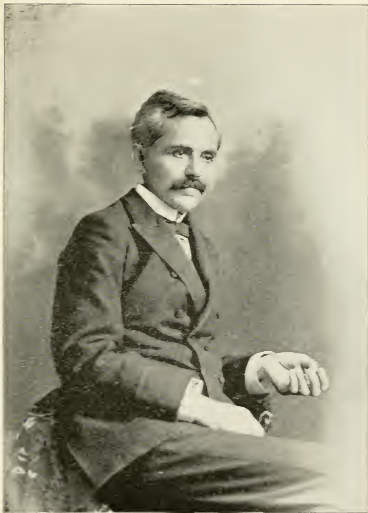
JOSEPH W. FIFER. Governor of Illinois.