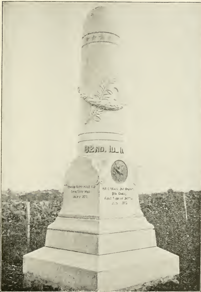
82d Illinois Infantry, Gettysburg.