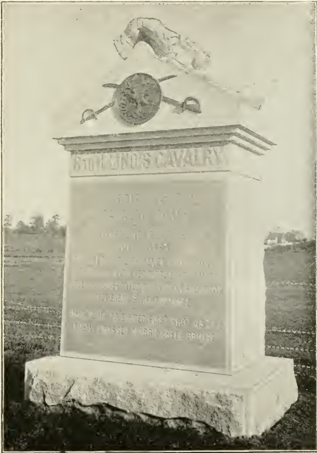
8th Illinois Cavalry, Gettysburg.