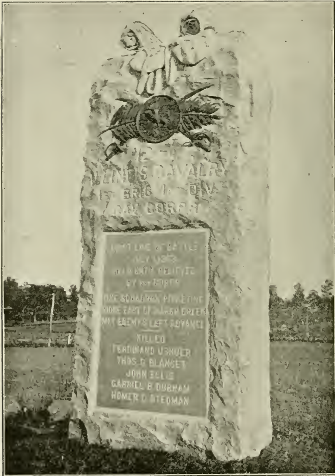
12th Illinois Cavalry, Gettysburg.