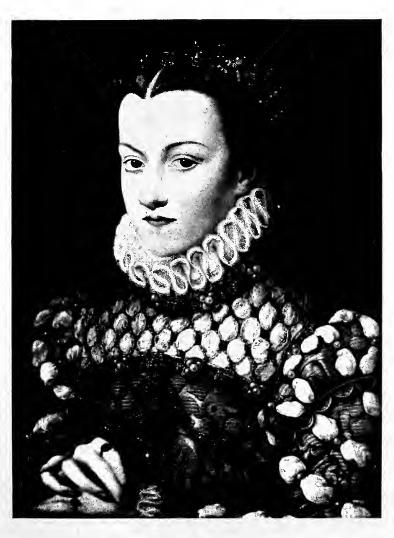
Isakella of Tustria. wife of Charles II