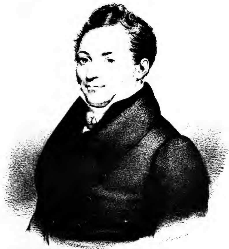
Etienne Cabet (1788-1856)