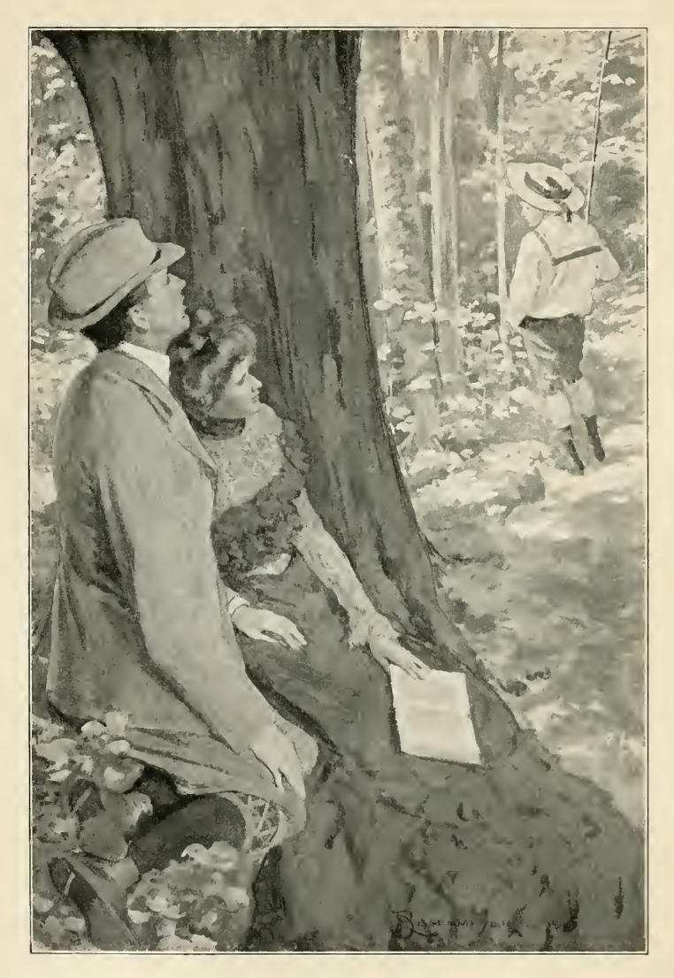
He looked back once or twice hesitatingly, but they did not call him.