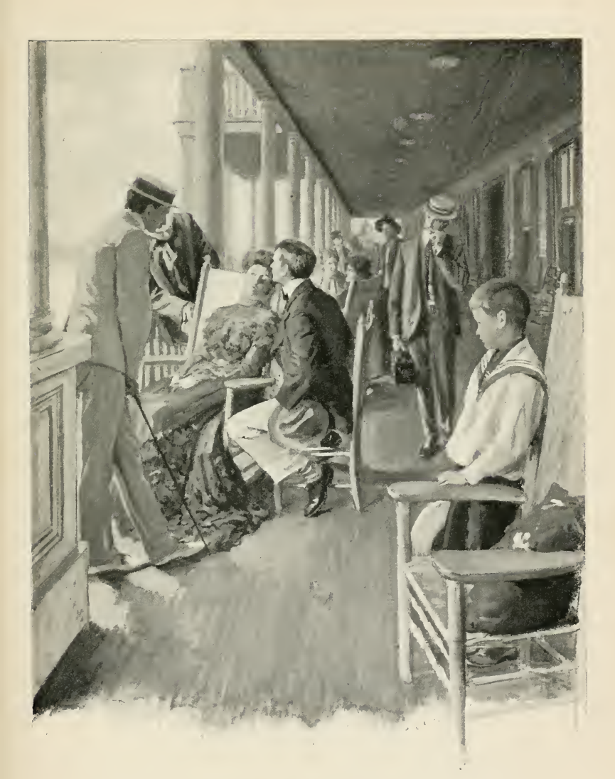
So he lurked on the outside of the ring that always surrounded her.