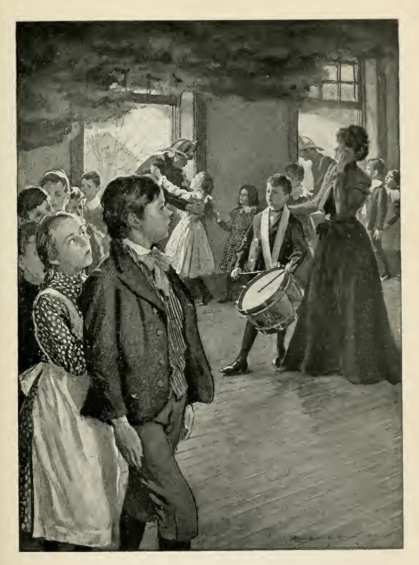
"As they went round, till every girl was lifted out."