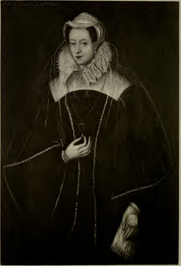
Mary Queen of Scots (The "Morton" Portrait)