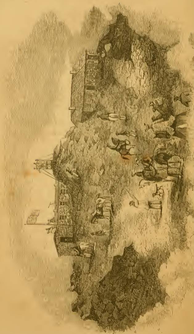
TOP OF M t . WASHINGTON 6285 FEET ABOVE THE LEVEL OF THE SEA.