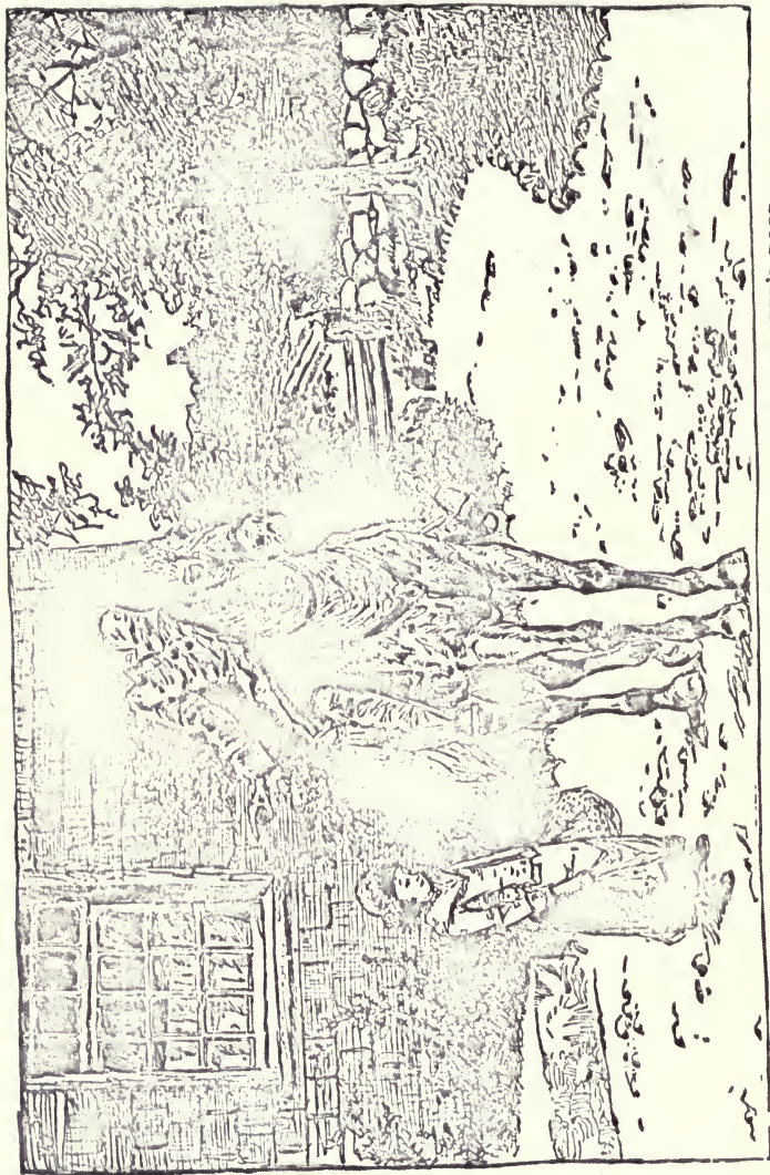
THE SMALL APPRENTICE IS SET DOWN AGAIN AT HER MASTER'S DOOR.