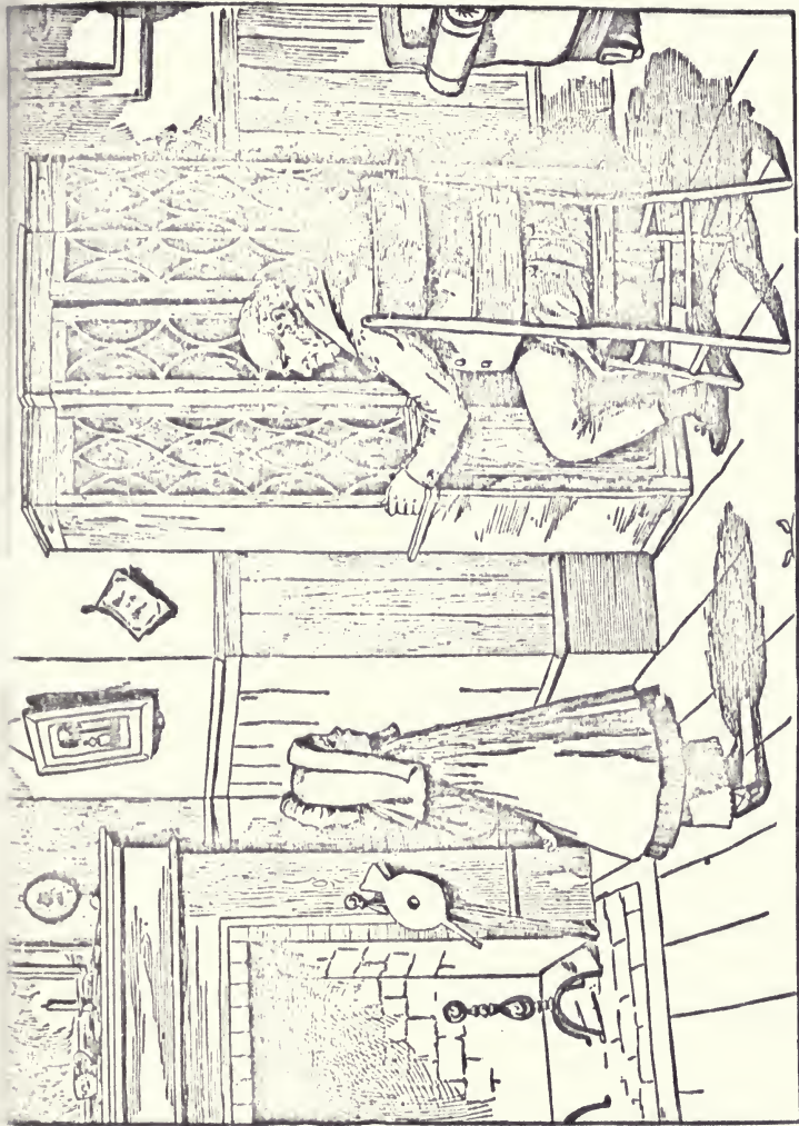
LITTLE PATIENCE OBEYS THE SQUIRE'S SUMMONS.