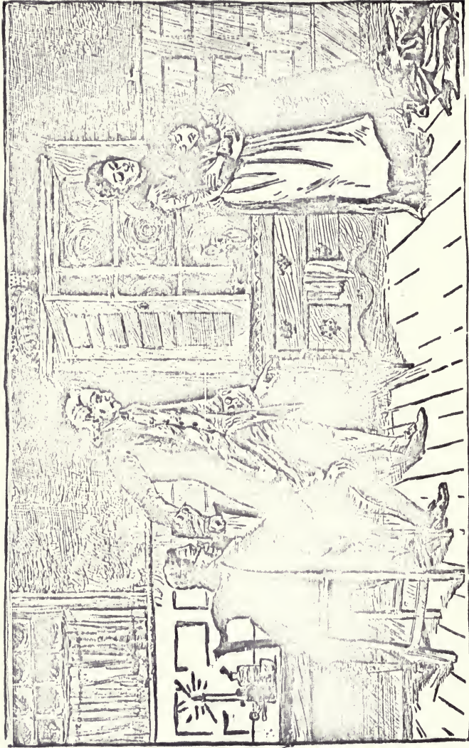
SHE ALMOST FAINTED FROM COLD AND EXHAUSTION.