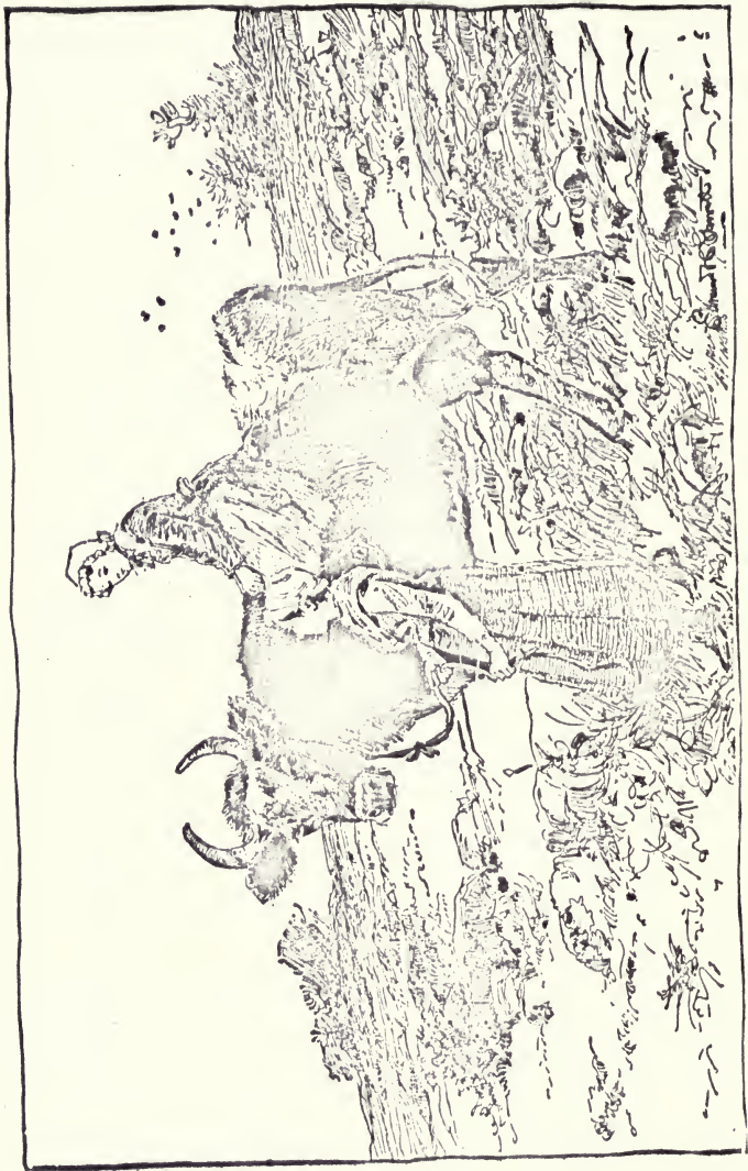
A CONVEYANCE IS FOUND.