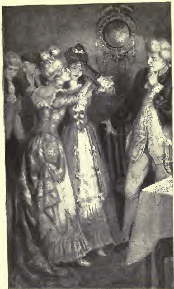
Mistress Kitty caught her in her warm arms.