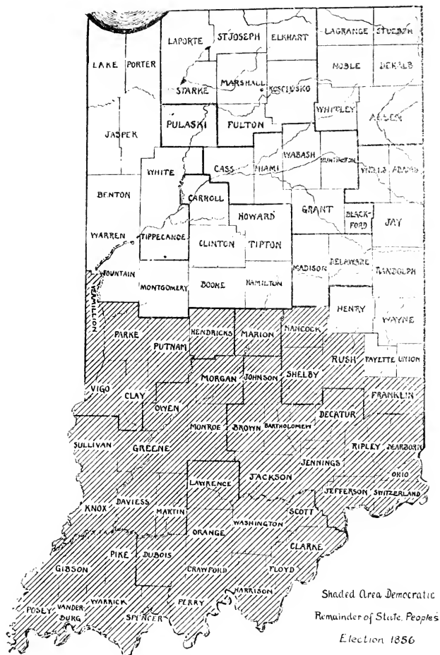
CONGRESSIONAL ELECTION 1856