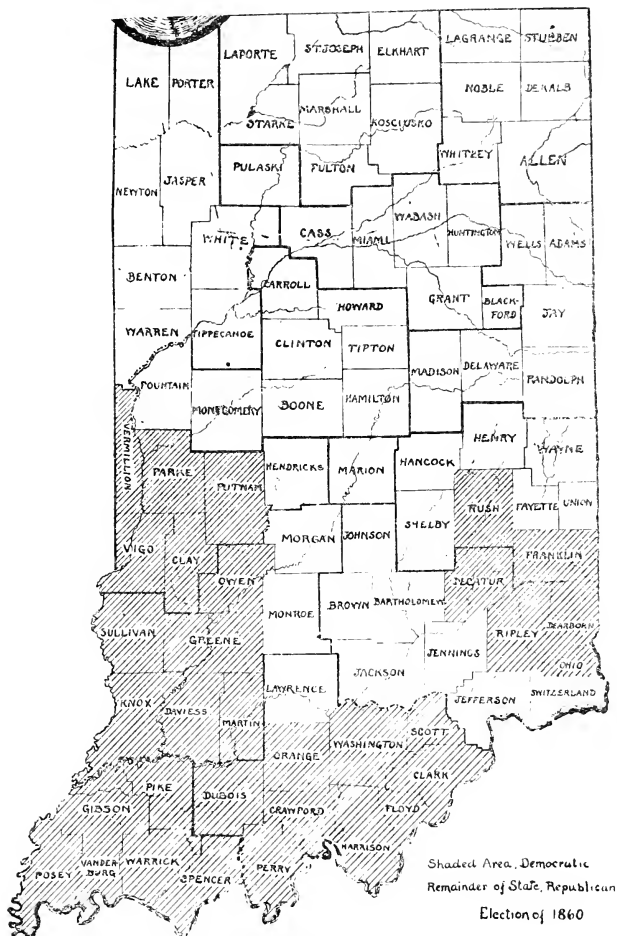
CONGRESSIONAL ELECTION 1860