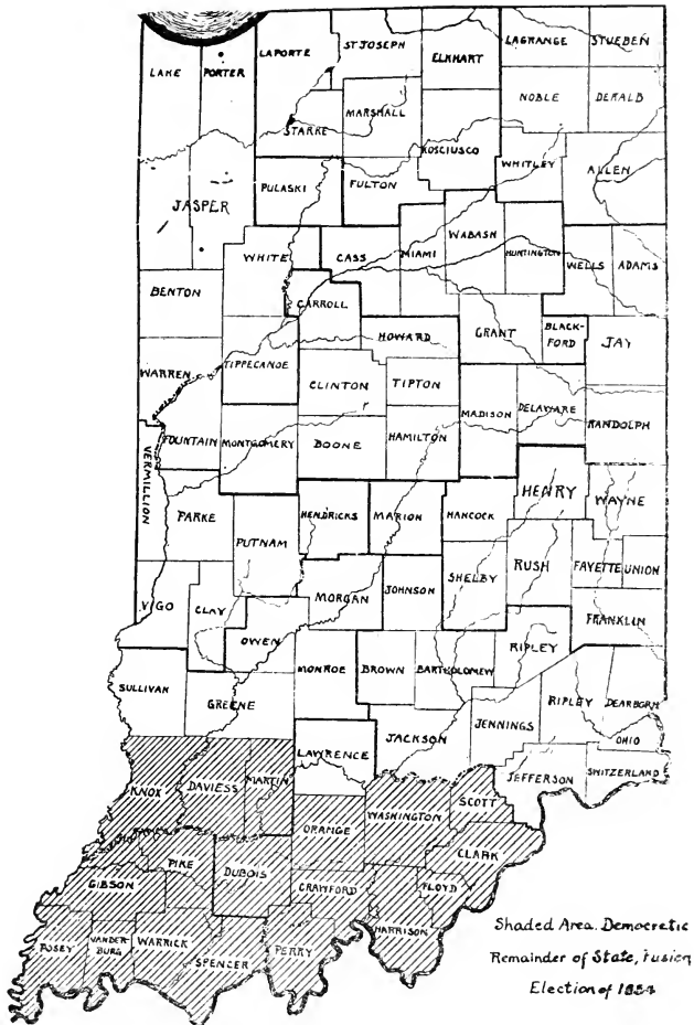
CONGRESSIONAL ELECTION 1854