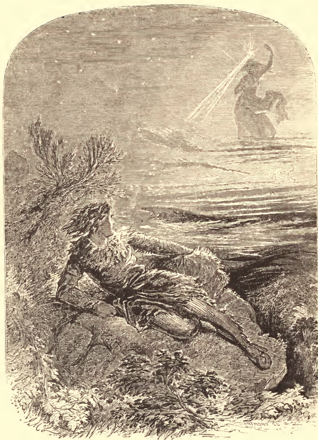
THE MORNING STAR AND HER BROTHER. Page 212.