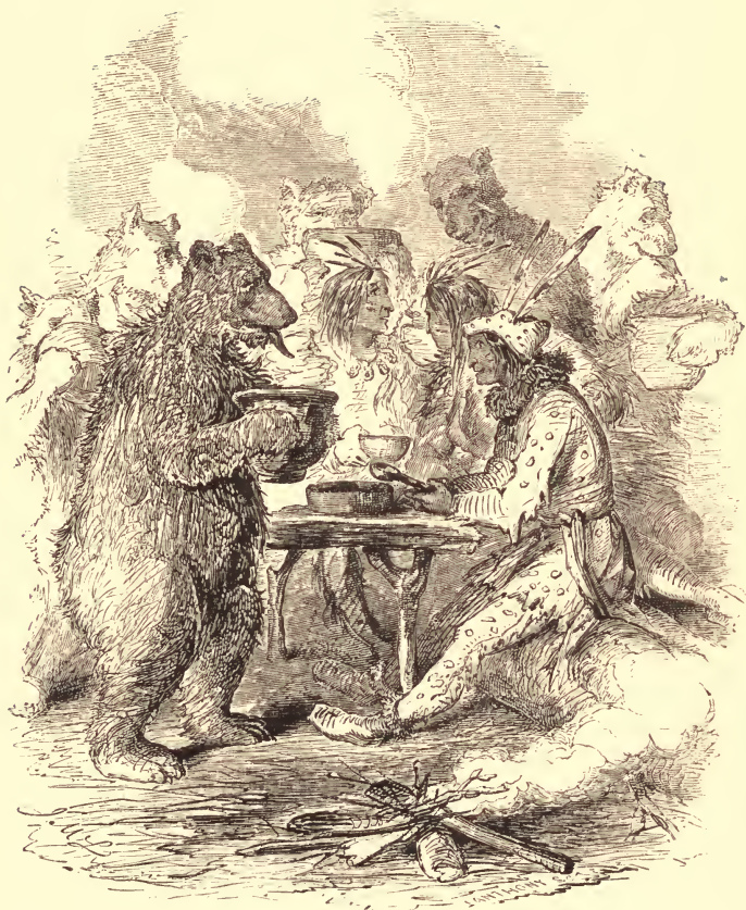
THE BEAR SERVANTS. Page 59.