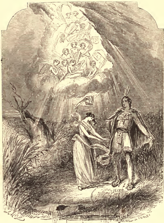
THE CELESTIAL SISTERS. Page 11.