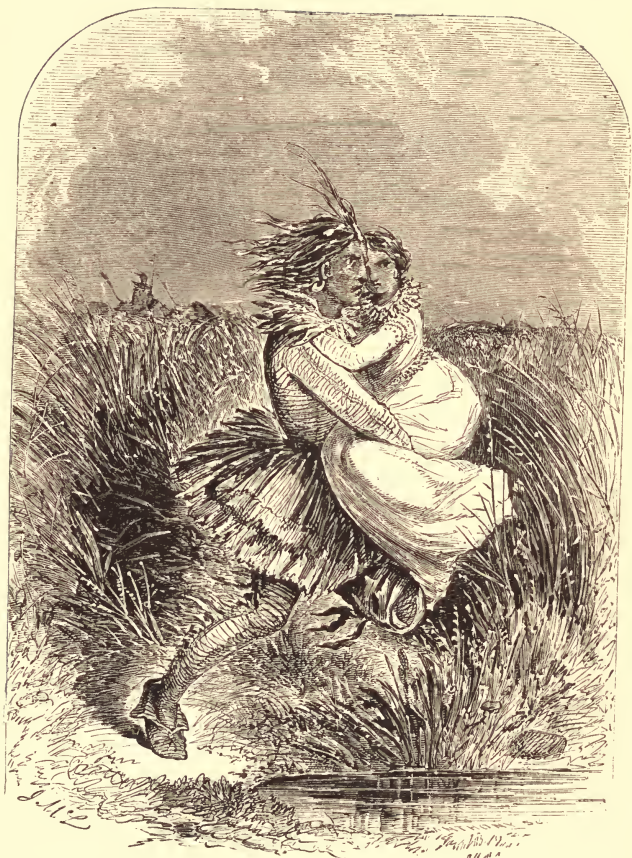
THE MAN WITH HIS LEG TIED UP. Page 176.