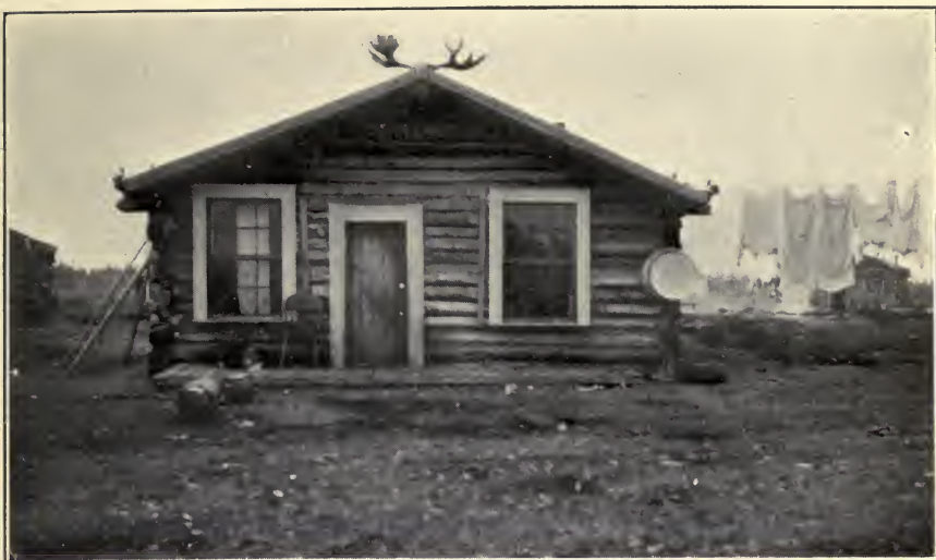
INDIAN CABIN, FORT YUKON, ALASKA.