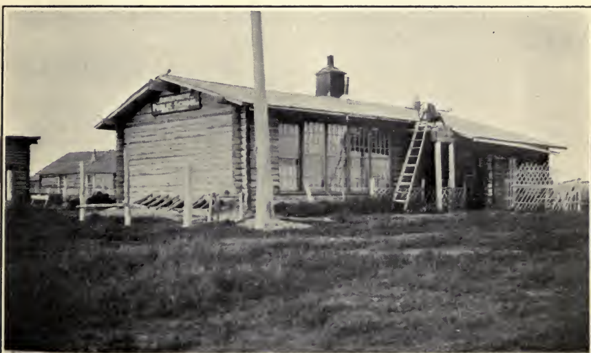
GOVERNMENT SCHOOL, FORT YUKON, ALASKA.