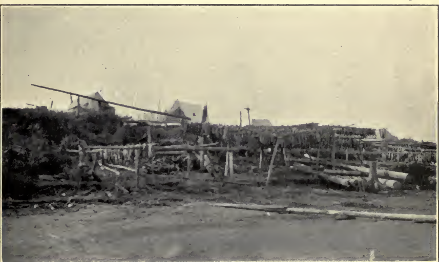
INDIANS CURING FISH, NEAR KALTAG, ALASKA.