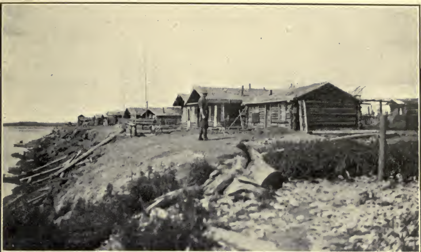
STEPHEN'S VILLAGE, ON YUKON RIVER, ALASKA.