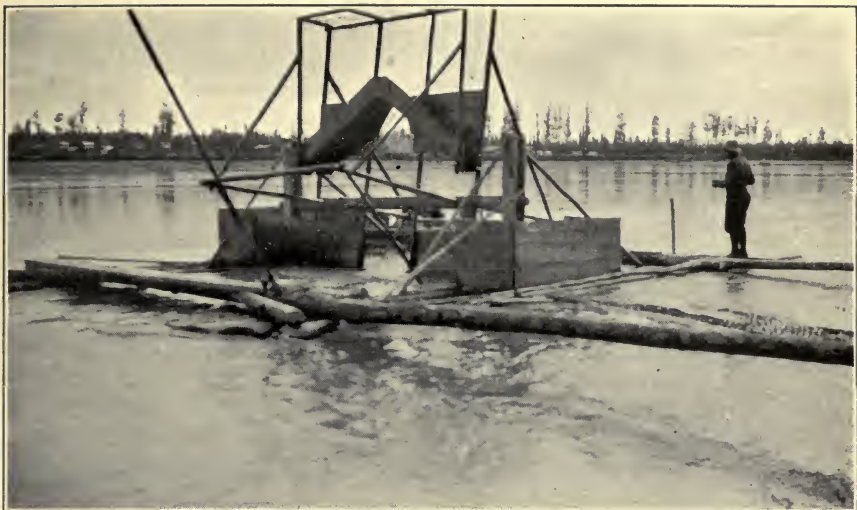
INDIAN "FISH WHEEL" FOR CATCHING SALMON, TANANA RIVER, ALASKA.