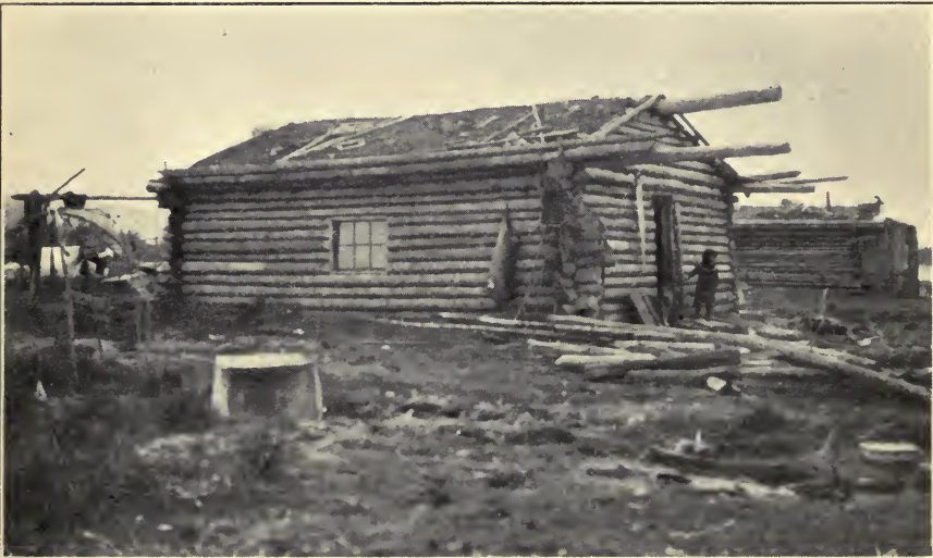
INDIAN CABIN, EAGLE, ALASKA.