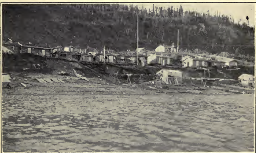
INDIAN VILLAGE ON YUKON RIVER—LOUDEN, ALASKA.