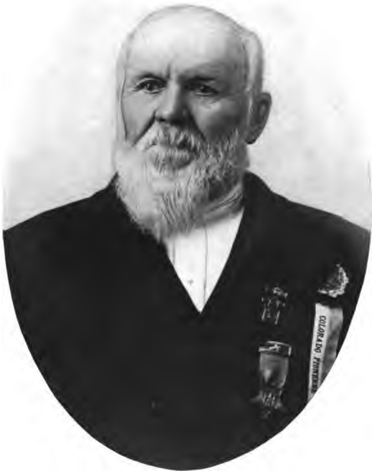
John M. Chivington Colonel First Colorado Volunteer Cavalry