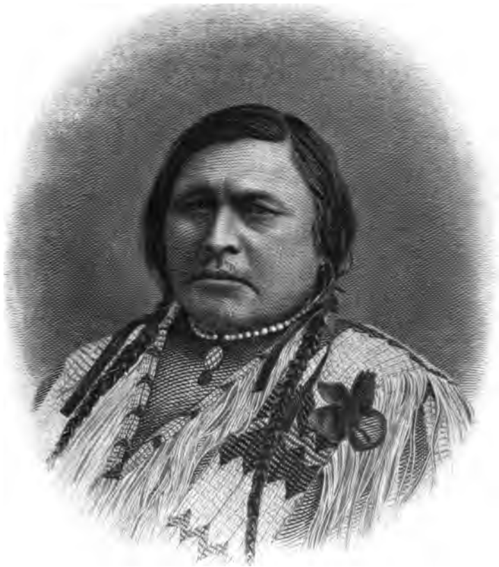
Ouray Chief of the Utes