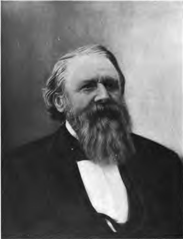
Hon. John Evans Governor of Colorado, 1862-1865