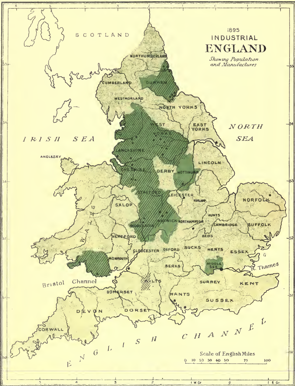
Manufacturing districts are shown by slanting lines large manufacturing towns by black circles, and the most populous counties are coloured darker than the others. It will be noticed that population since 1750 has shifted very much to the North and North West of England, whilst manufactures are far more concentrated than formerly. (Compare the Map opposite page 350)