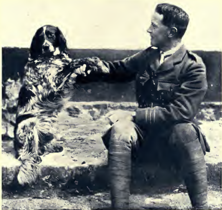
John McCrae and Bonneau