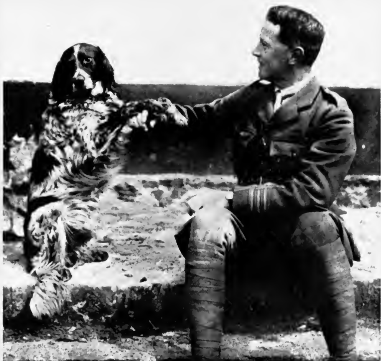
John McCrae and Bonneau