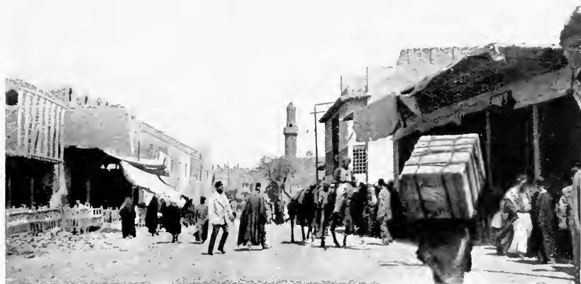
BANK STREET, BAGHDAD (LOOKING TOWARDS EXCHANGE SQUARE).