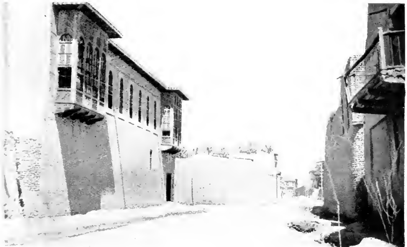
EXTERIOR OF THE A.P.O.'S BILLET (ON THE LEFT).