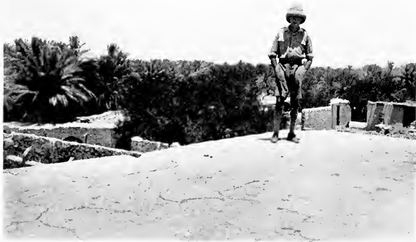
VIEW FROM OUR ROOF, LOOKING TOWARDS THE GARDENS.