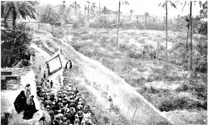
ARAB RELIGIOUS PROCESSION.