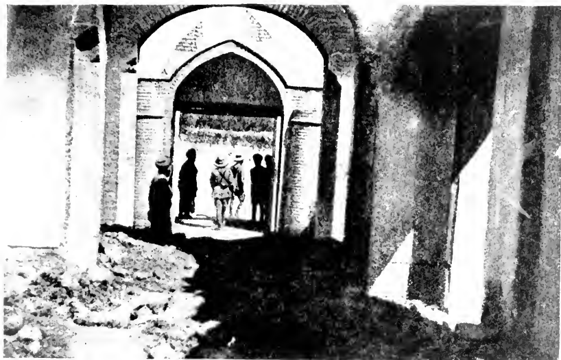
GATEWAY OF THE QESHLAH AFTER THE SIEGE