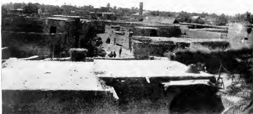
SHAHRABAN (FROM THE ROOF OF OUR BILLET).