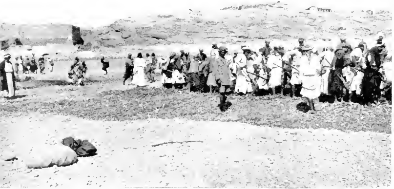
PREPARATIONS FOR BUILDING THE BUND AT TABLE MOUNTAIN.