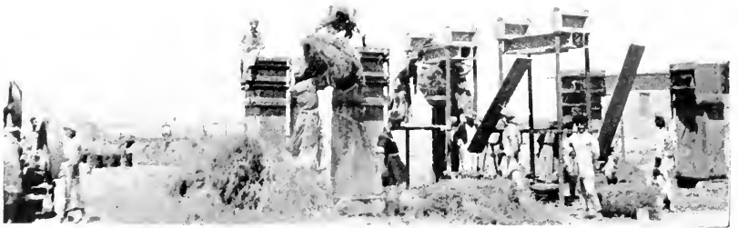
BALING PRESSES AT SHAHRABAN.