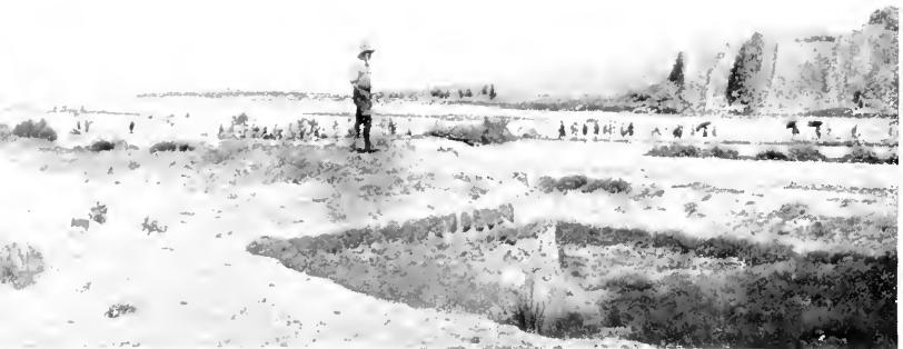
THE BUND IN COURSE OF CONSTRUCTION; AND MY HUSBAND ON CYRUS'S WALL.