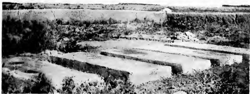
THE ONLY MEMORIAL OF AUGUST 13th: THE GRAVES AT SHAHRABAN.