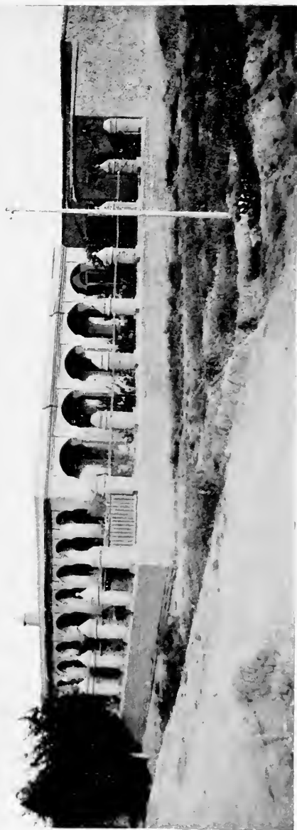
THE QESHLAH ' AT SHAHRABAN.