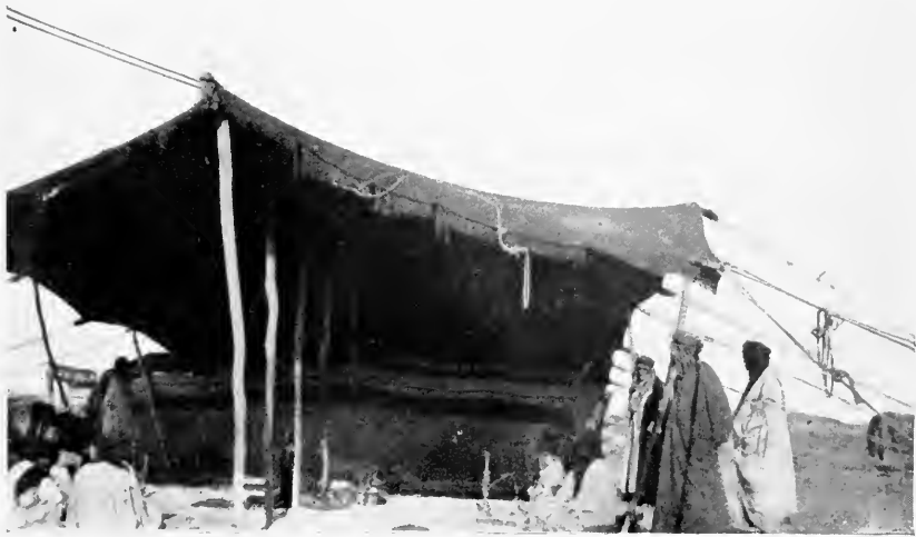
DESERT TENT OF BLACK GOAT-HAIR.