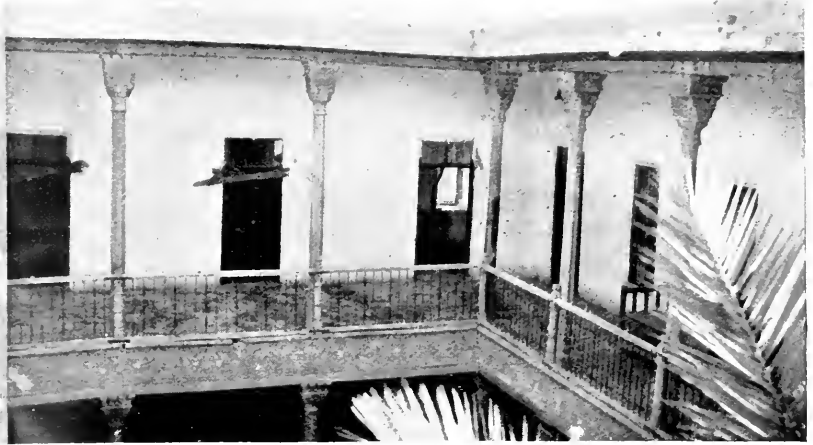
INTERIOR OF THE A.P.O.'S BILLET.