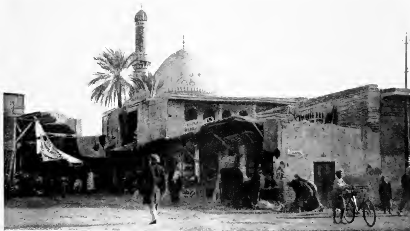
NORTHERN ENTRANCE TO BAZAARS, BAGHDAD.