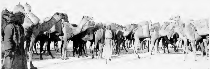
CAMEL CARAVAN OUTSIDE SHAHRABAN.