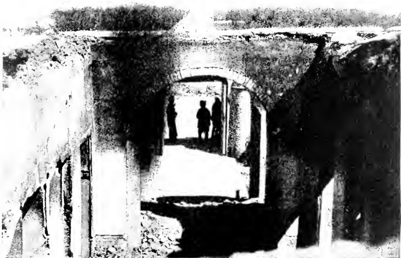
RUINS OF THE QESHLAH