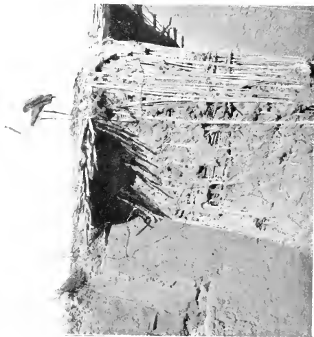
STORKS' NESTS AT SHAIKABAN.