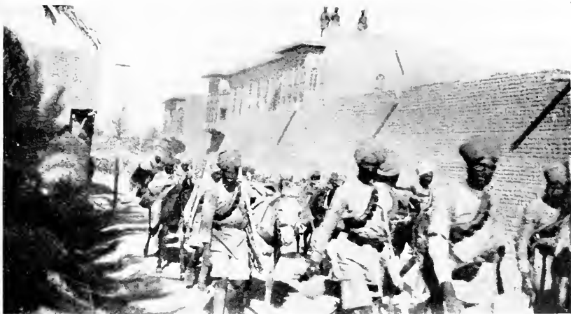
THE RELIEF COLUMN ENTERING SHAHRABAN.