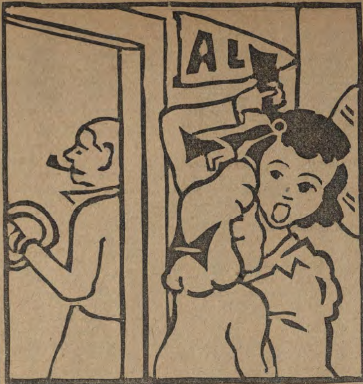
He's not exactly my type but I may be able to get his trophy collection for the scrap drive.

Again it would like to be stressed that freshmen are cordially invited to join any of these organizations which might appeal to