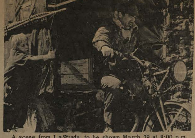
A scene from LaStrada, to be shown March 29 at 8:00 p.m. in Jenkins Auditorium. Admission is free.

Future showings will be held on Fridays in Jenkins Hall at 8:00 p.m. Admission is free.