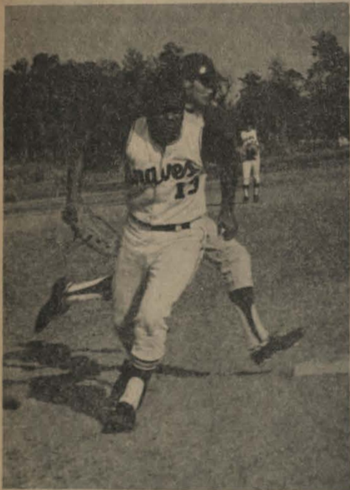
Armstrong's Pirates fight against the Braves at a home game.