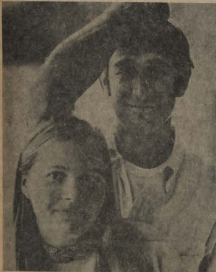
The Pozo Seco Singers will give a concert Friday, May 2 as part of Pioneer Days.