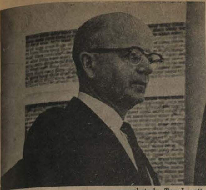
Governor Maddox addresses the students, faculty, and members of the community during dedication ceremonies.