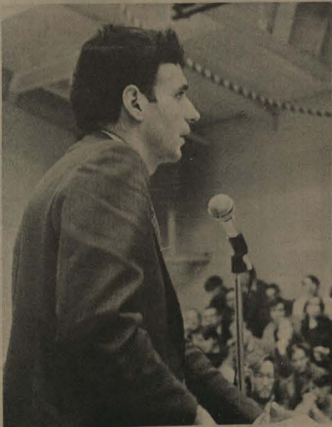
Nader Tells It Like It Is

Libraries using Checkpoint have reported that their losses have been reduced by 85 to 87.4 percent, so the system should benefit the entire college community of users. Help the librarians help you by remembering to show all library materials to the desk attendant as you leave the library.