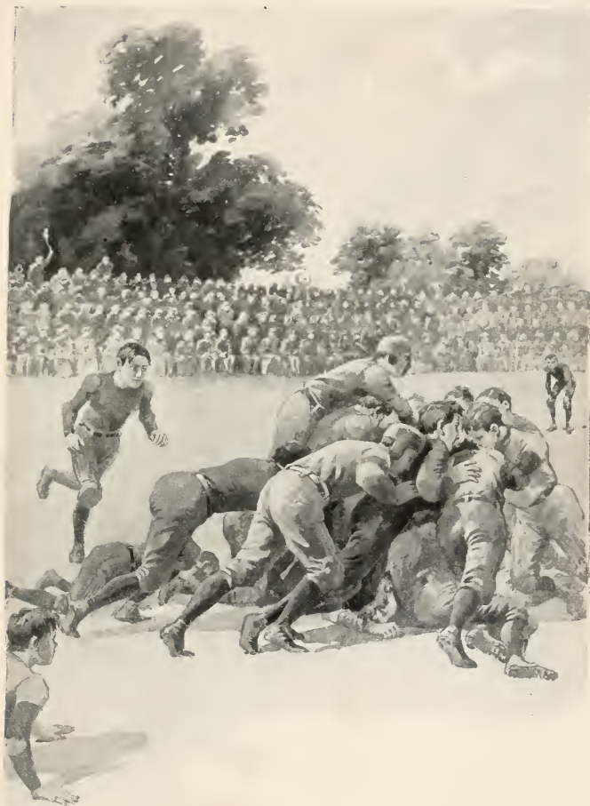
THE PILE THAT COVERED THE BALL THREE YARDS BEYOND.