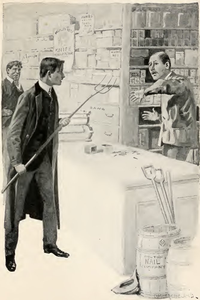
"PICK UP THAT HAT, DO YOU HEAR!" — Page 118.