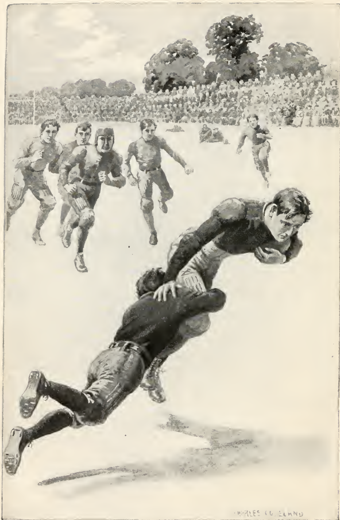
DOWN THE TWO WENT IN A WHIRL OF LEGS. — Page 290.