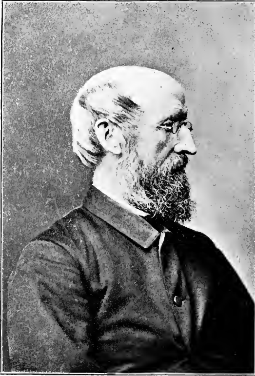
PRESIDENT OF ROBERT COLLEGE, 1872