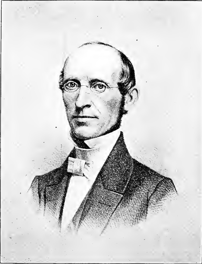
CYRUS HAMLIN, MISSIONARY, 1855