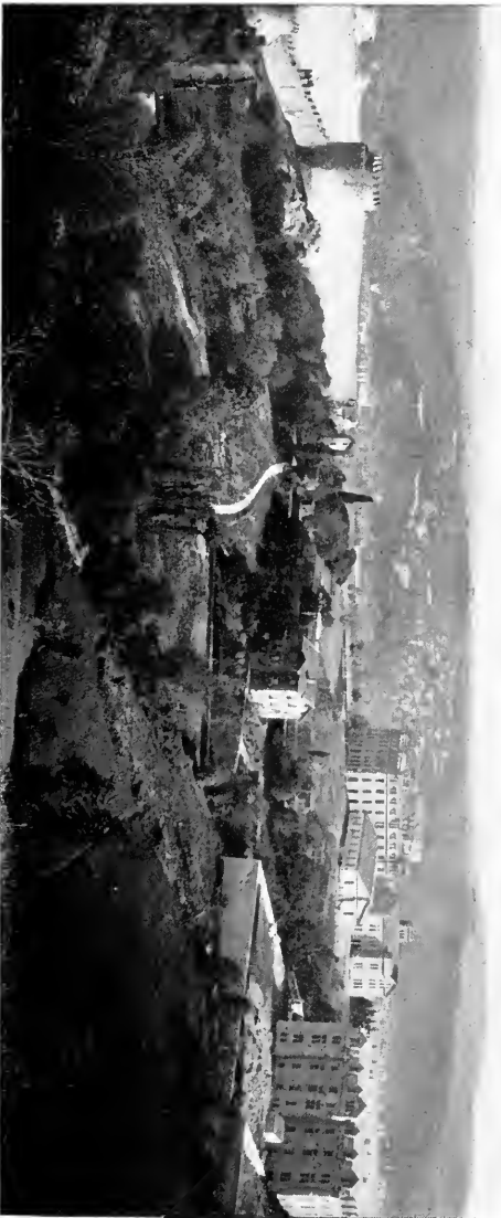
ROBERT COLLEGE IN 1902