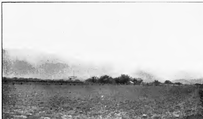
INDIAN FARM AT ALAMO BONITA