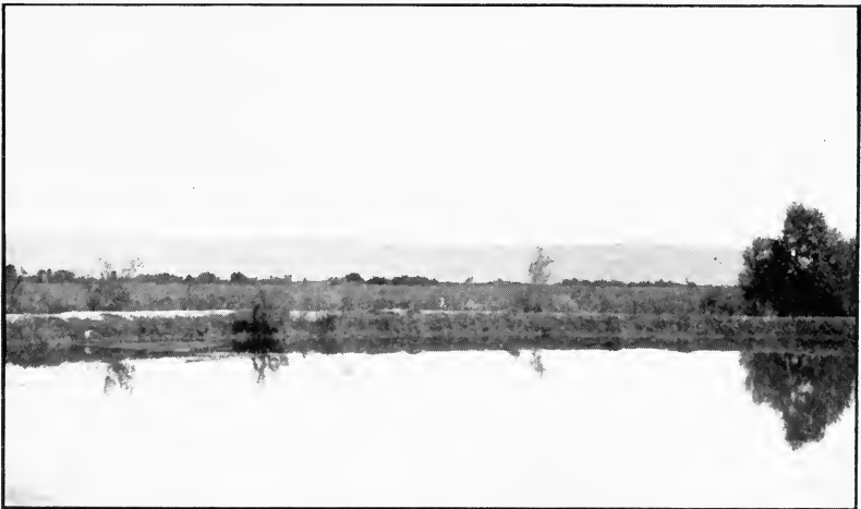
A RESERVOIR ON THE TORRES RESERVATION

Considerable difficulty was encountered in providing for the Indians of the Smith River Band , numbering 246, living in several groups along Smith River in Del Norte county. After the selection of 240 acres of good agricultural land had been made, a protest was filed on the score that the price to be paid, $7200, was excessive. Investigations covering some months did not sustain this contention, but it did develop that the Indians preferred land on the river or the Pacific Ocean, because, as they said, they had been a fish-eating race from remote ages and did not wish to be deprived of