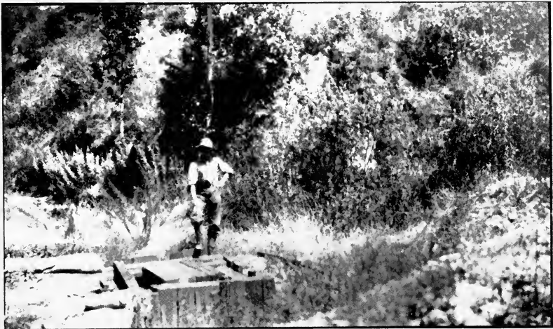
ENTRANCE TO INFILTRATION GALLERY AT SAN MANUEL