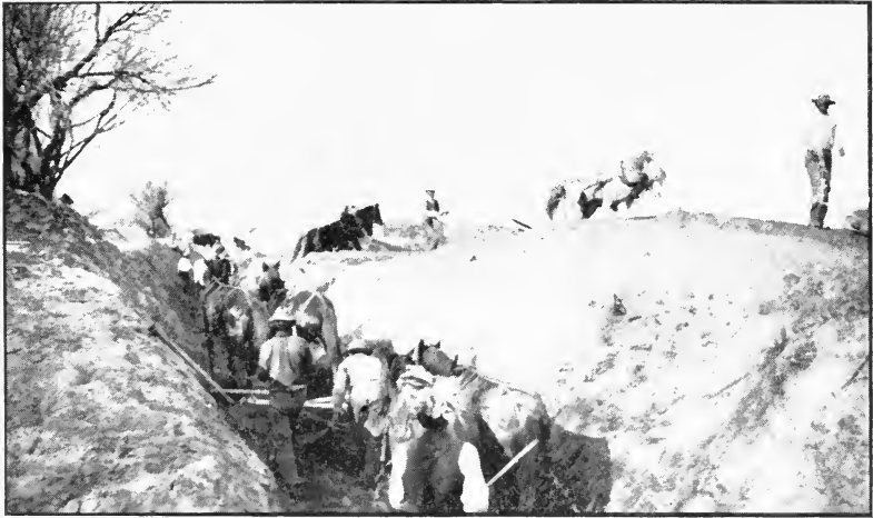
INDIANS BUILDING IRRIGATING DITCH

been set aside and a couple of small ranches, with an available water supply, have been purchased for their benefit. Surveys have been made and work will shortly be commenced on the construction of either small ditches or small pipe lines to irrigate these ranches. With these two ranches under irrigation, and the adjoining land available as a cattle range, the Indians should shortly become well-to-do.