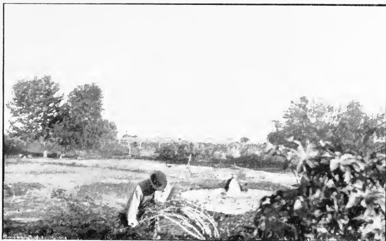
A TORRES FARMER AT WORK

Dear Sir:—Yours of the 2nd duly received. I enclose you herewith a sort of statement of what has been done in Southern California in the last three years (somewhat less). I have tried to make it as brief as possible, and still it is quite extensive. The most important thing remaining is the establishment at Campo. The last tract there and the one we had to have was not finally through until about June. It belonged to an estate with minor heirs and it took time. The new reservation has been included within the National Forest, which will make it much easier getting along with the