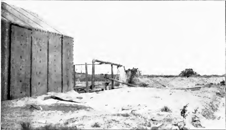
PUMPING PLANT AT COACHELLA

The question of the water-supply is vital to almost every inhabitant of Southern California, and an appreciable part of the funds appropriated for