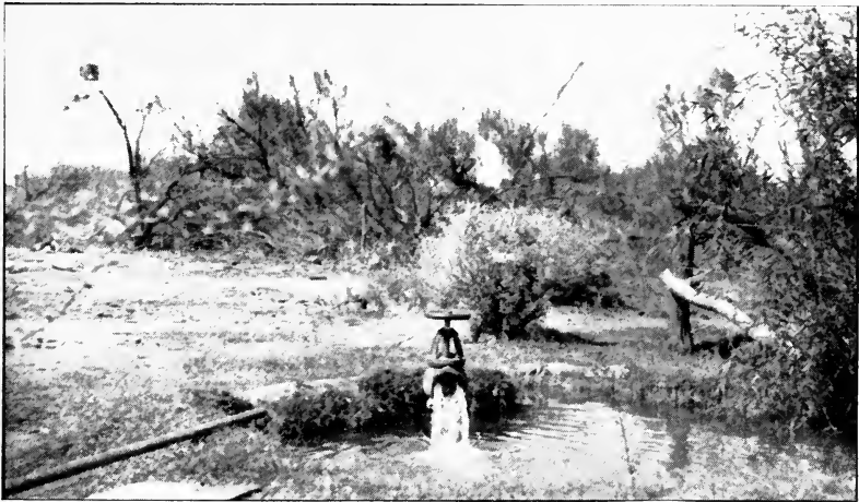
ARTESIAN WELL ON TORRES RESERVATION

At Torres, Martinez and Alamo Bouito about forty new wells are now being bored, in addition to the twenty-two bored by the Government six years