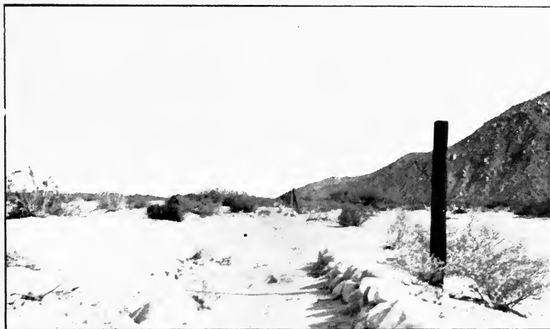
ON AGUA CALIENTE RESERVATION

In lower Eel River Valley , in Humboldt county, are to be found 88 Indians who are the remnants of three or four bands once populous and representing two diverse stocks of the race, always inimical. For this reason it has been thought not feasible to attempt to assemble them upon one tract of land; but, instead, the purpose is to buy two, and possibly three, pieces of land in Eel River Valley. The purchase of one tract of 80 acres is practically closed