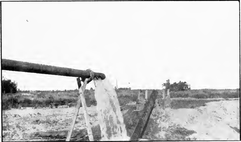
WATER ON A RESERVATION

These acts, carrying appropriations amounting to $150,000, were framed in consonance with the existing conditions in California, where a tract of good land of 2 to 10 acres in area is sufficient to afford support to a frugal family. This has been the design of the Office, through Special Agent Kelsey, in expending the money thus appropriated—to purchase fertile lands