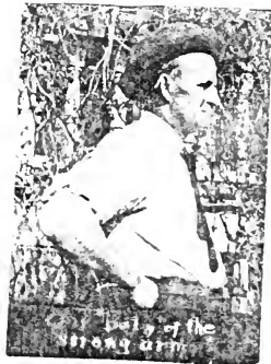
The Original West.