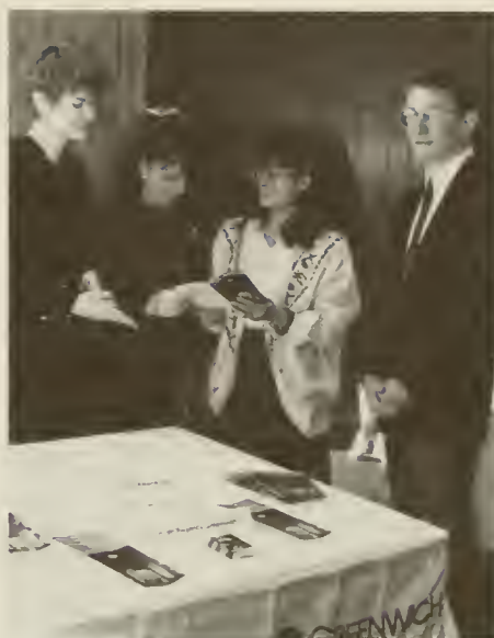
CAREER EXCHANGE —Recruiters from more than 10 corporations participated in a "Career Opportunity Day" for students sponsored recently by the School of HRTA in the Epicurean Dining Room.