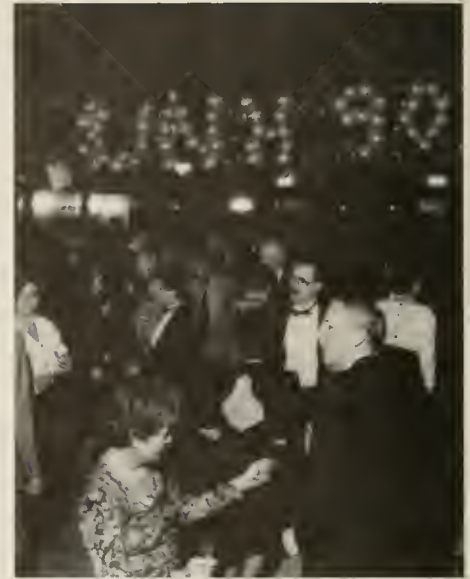
Partygoers danced to a medley of tunes which included favorites such as Glenn Miller's "In the Mood" and Bette Midler's "Wind Beneath My Wings."