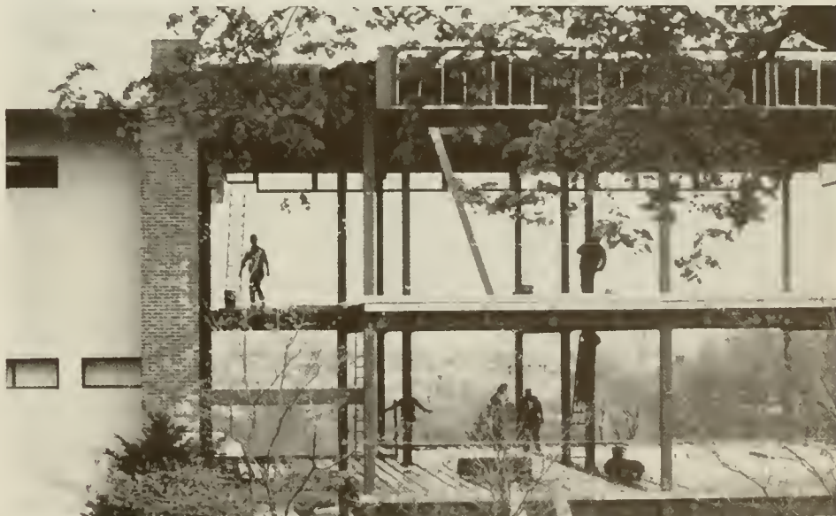
PROGRESS—Construction of the $1.7 million addition to the Jacob F. Buckman Hall of Engineering and Applied Science is well underway. Since the photo above was taken, workmen have encased the steel framework, bringing the project even closer to completion by September for the start of the academic 1990-91 year.