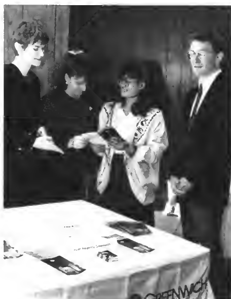
CAREER EXCHANGE—Recruiters from more than 10 corporations participated in a "Career Opportunity Day" for students sponsored recently by the School of HRTA in the Epicurean Dining Room.