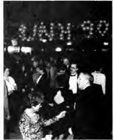
Partygoers danced to a medley of tunes which included favorites such as Glenn Miller's "In the Mood" and Bette Midler's "Wind Beneath My Wings."