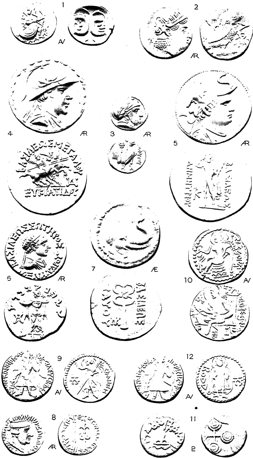
Indo-Greek and Indian Coins