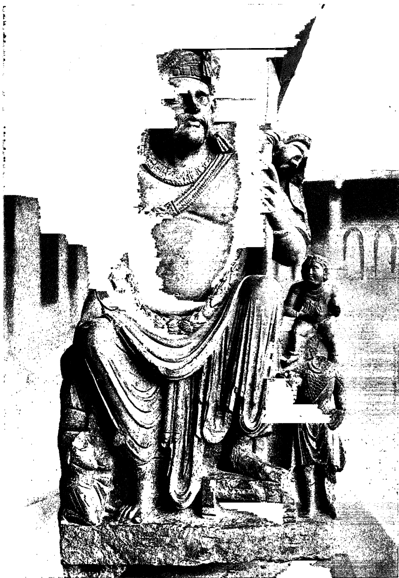
Kuvera. (From an Indo-Greek sculpture)