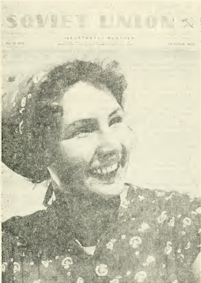
EXHIBIT No. 2—SOVIET UNION