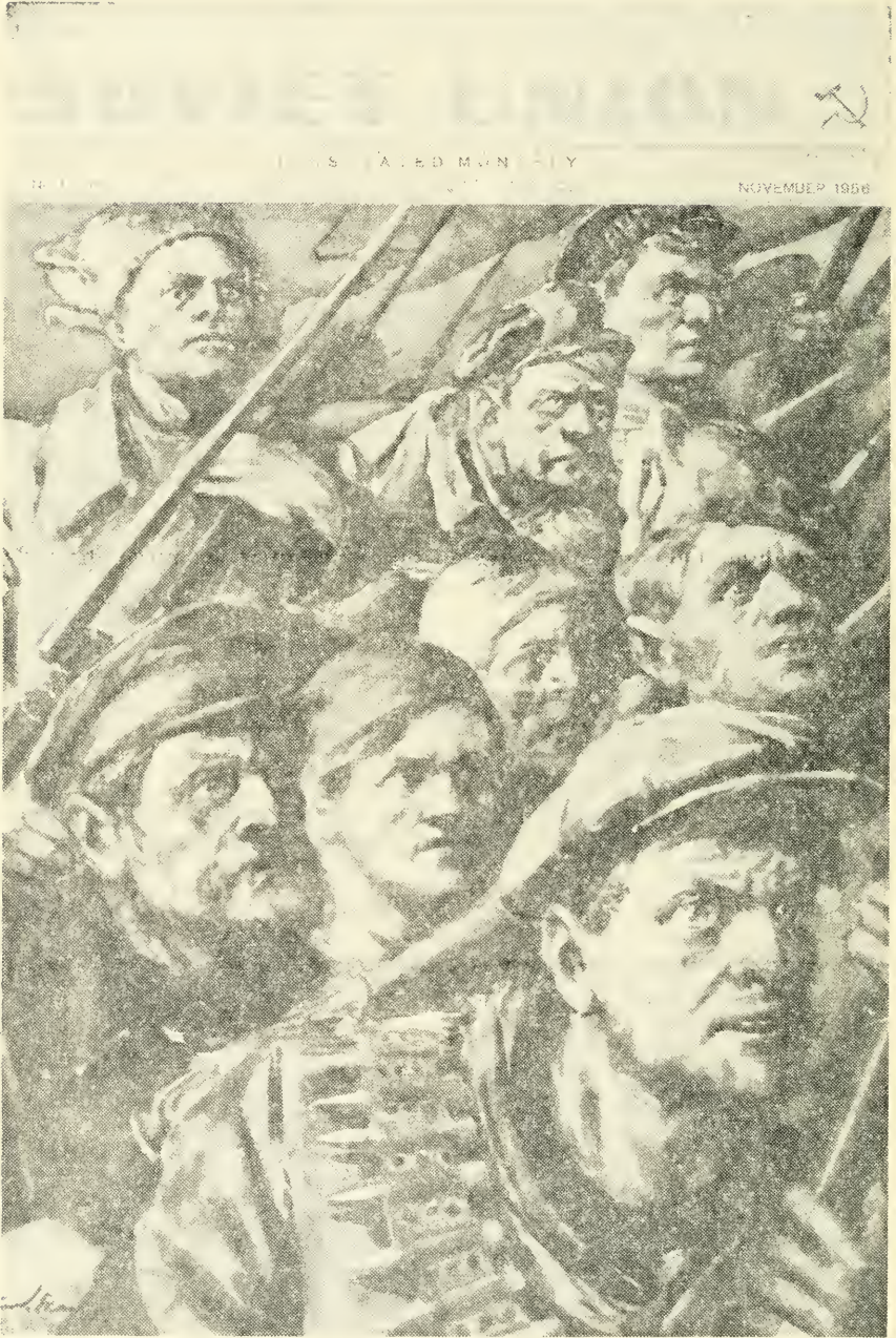
EXHIBIT No. 1—SOVIET UNION