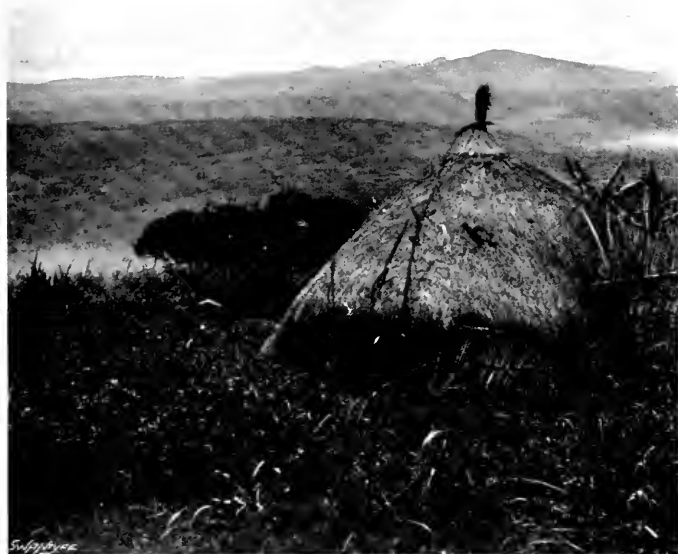
KING'S HOUSE, TORO; THE RUWENZORI MOUNTAINS IN THE DISTANCE