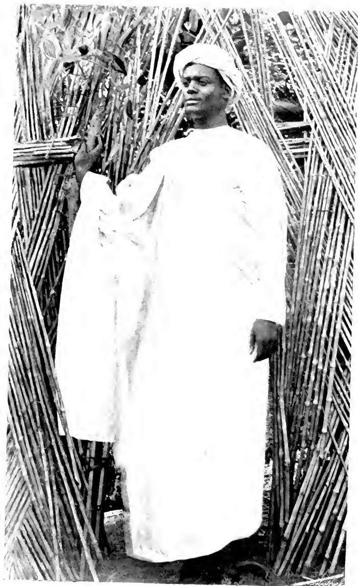
DAVID KASAGAMA, KING OF TORO