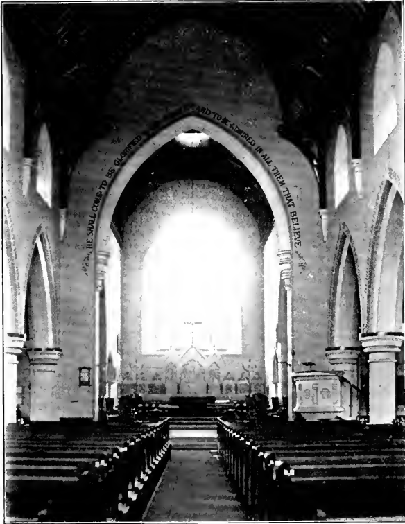
ALL SAINTS' CHURCH, PLUMSTEAD, WOOLWICH