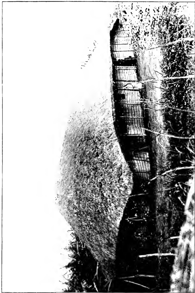
ST. JOHN'S CHURCH, TORO