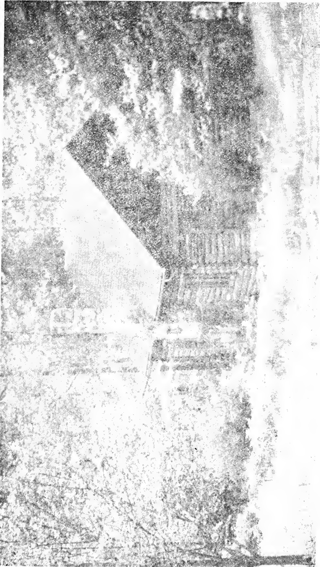
BINKLEY EXHIBIT No. 1.—Binkley residence at Walnut Cove, N. C., used by Communist Party for leadership training school in 1952.