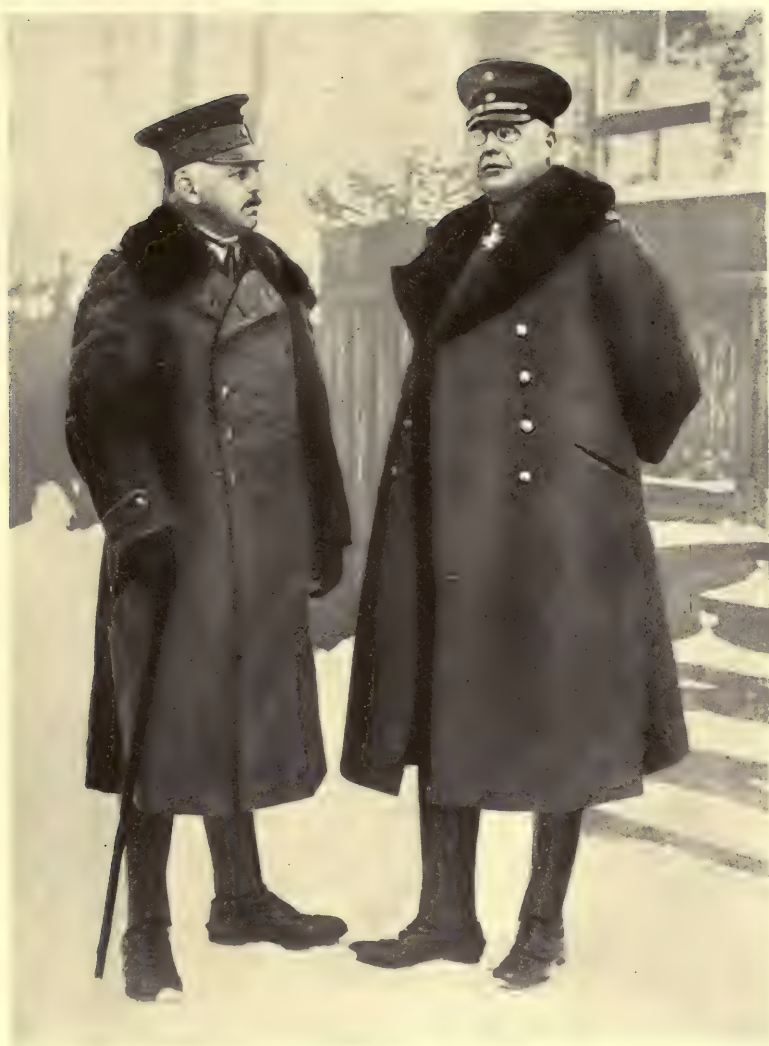
GEN. HOFFMANN ( on right ) WITH MAJ. BRINKMANN