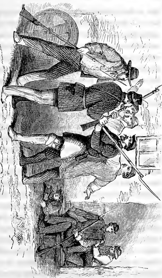
"Just as they were turning to receive the relief-guard, I crawled backward under the building, and disappeared from view." Page 172.